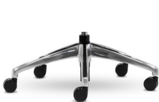
Optional Polished Aluminium Base