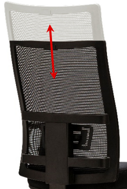
EASY-Adjust Ratchet Back Height Adjustment