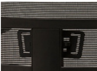
Lumbar Support (Standard)