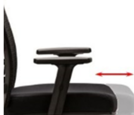
Seat Depth Adjustment (optional)