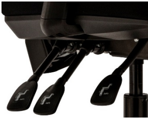
3 Lever Extreme ERGO Mechanism – Independent Seat Angle & Back Angle Tilt