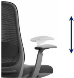
4D Adjustable Armrests (standard)