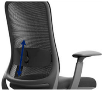
Adjustable Lumbar Support (Height adjustable & self-positioning depth + angle)