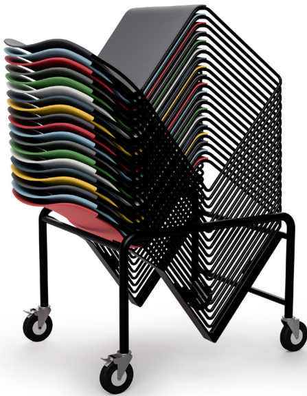
Dedicated Trolley (Stacks up to 10 chairs on floor/up to 40 on trolley)