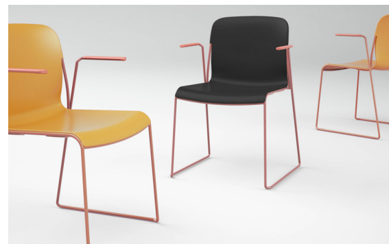
Frame Powdercoat Option