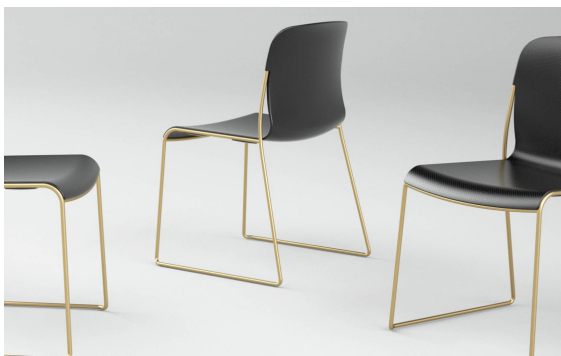
Brass Finish Option