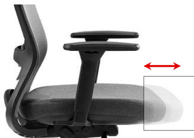
Seat Depth Adjustment (standard)