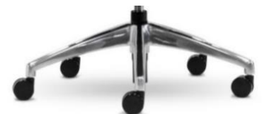
Optional Polished Aluminium Base