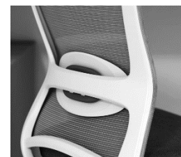
Adjustable Lumbar Support (standard)

Due to constant innovation, Advanta products may be subject to design and specification changes without notice. Copyright © Advanta 2018