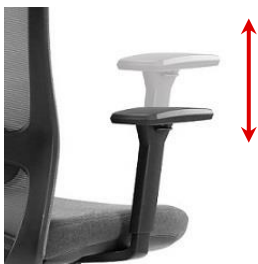
3D Adjustable Armrests (optional)