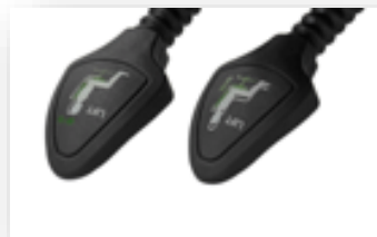
Highly Adjustable Ergonomic Mechanism