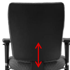
EASY-ADJUST BACK Height & Lumbar Adjustment