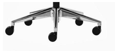
Optional Polished Aluminium Hi Arch Base