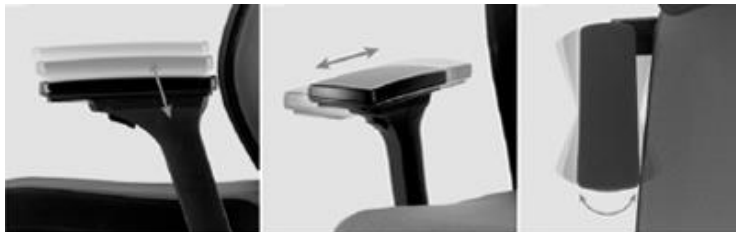
Optional 3 Dimensional Adjustable Armrests