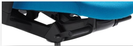
Advanced Dynamic Mechanism with EASY-Adjust Tension Control