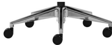
Optional Polished Aluminium Base