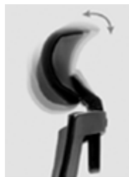
Optional Adjustable Headrest