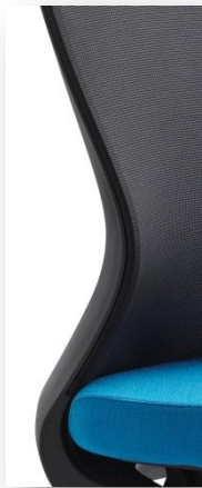
Mesh Backrest with exceptional S-Line Lumbar Support