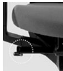
EASY-Adjust Tension Control