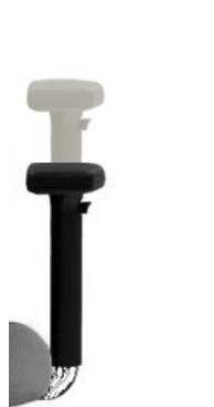
Optional Height Adjustable Armrests available in Black or Aluminium Finish