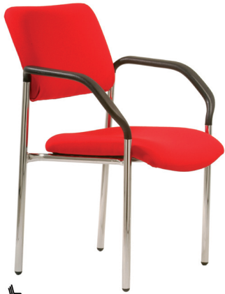
VISITOR MEDIUM FOVS360AS - C