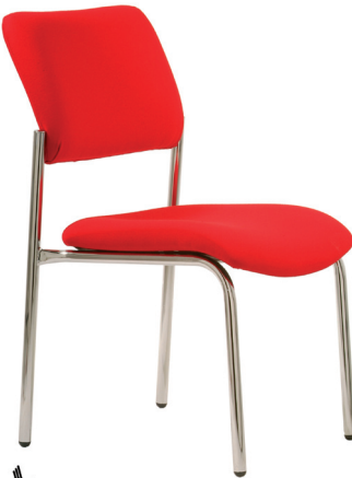
VISITOR MEDIUM FOVS360NA - C