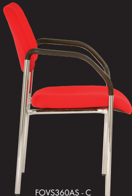
FOVS360AS - C