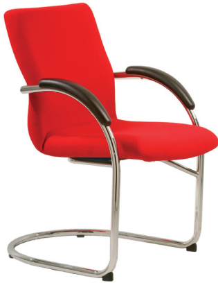
VISITOR CANTILEVER FOVS480AU - C