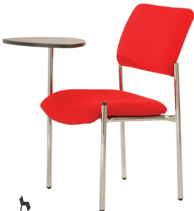
TABLET ARM FOWT360 - C